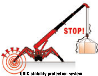
UNIC stability protection system